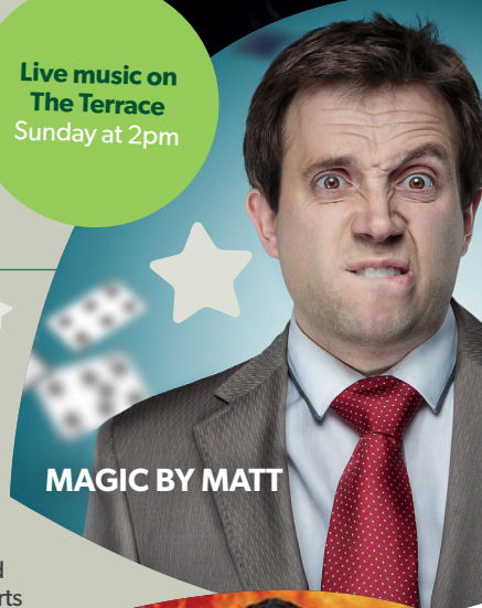
MAGIC BY MATT

31st August - PJ The Showman This show is ridiculous riot of fun bursting with variety including a kids comedy set, featuring magical mayhem, belly laughs and highly visual gags.